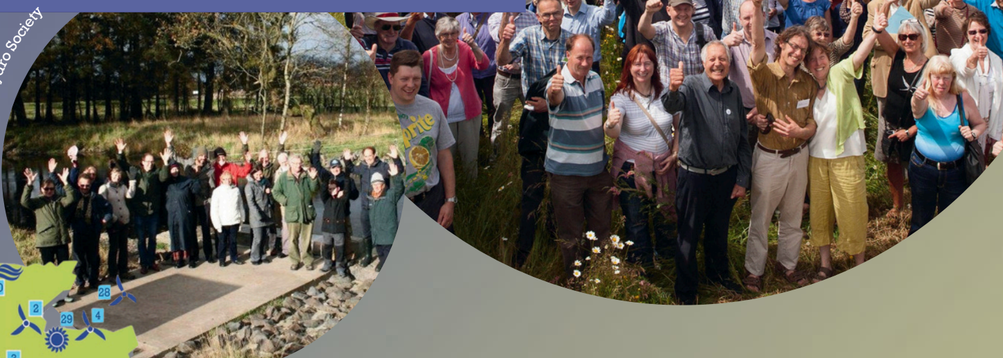
Rumbling Bridge Hydro Society