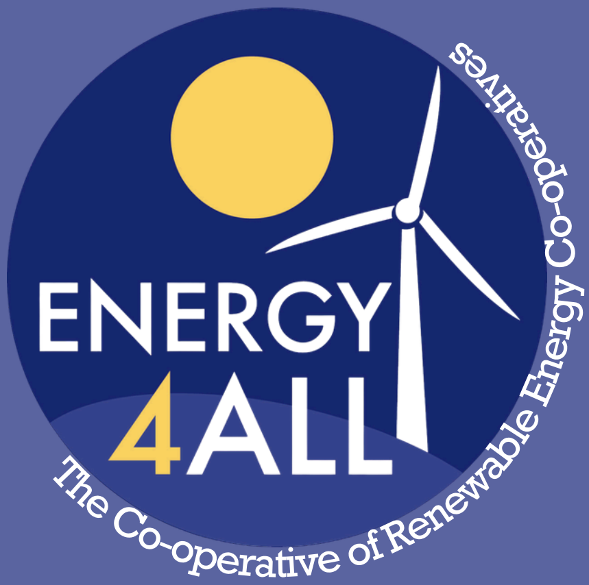
Westmill Wind and Solar Farm