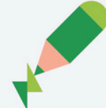
Bankable generation modelling