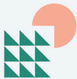
Solar PV installation